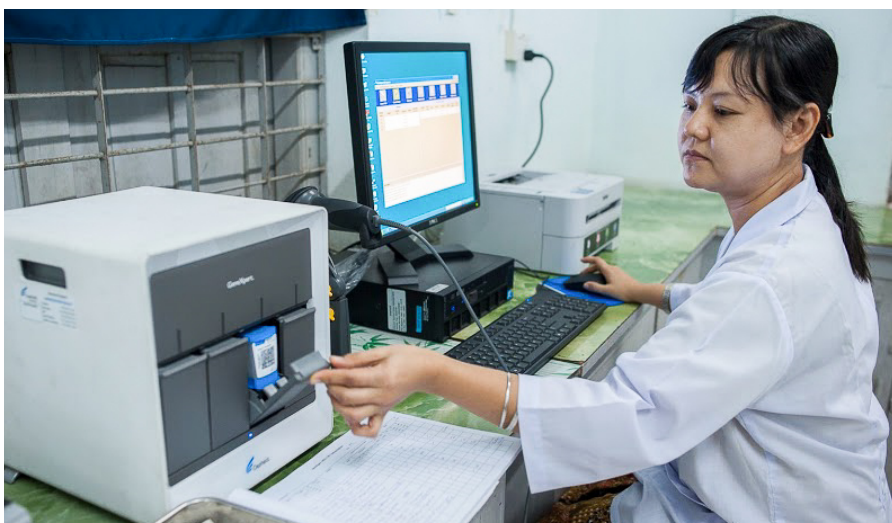
GeneXpert is a molecular test for TB that has been rolled out throughout Myanmar in collaboration with the country's government