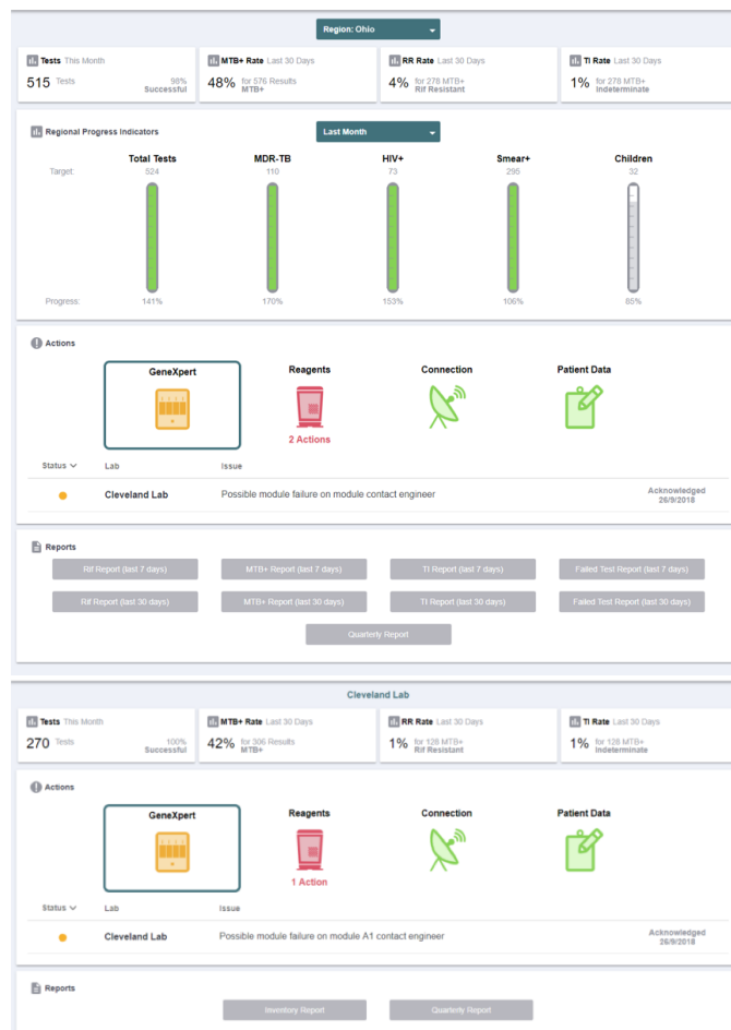
Example of redesigned dashboard

“Users cited the machine dashboard as clear and easy to use, indicating high acceptance. There was also greater visibility of the diagnostic profiles of the patients.”